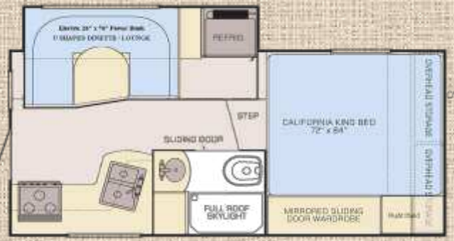
91003 Fits LB Trucks only