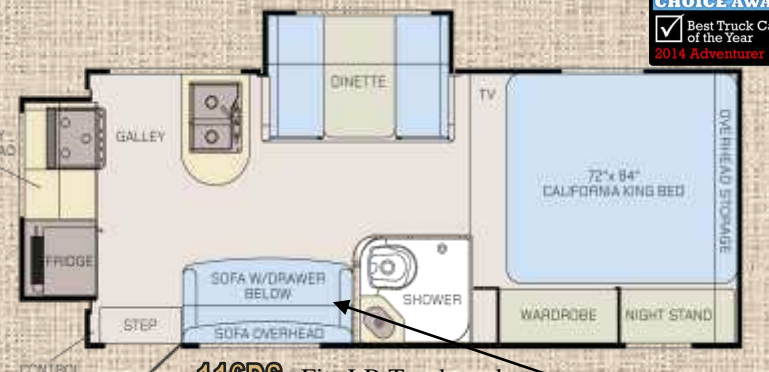
11608 Fits LB Trucks only