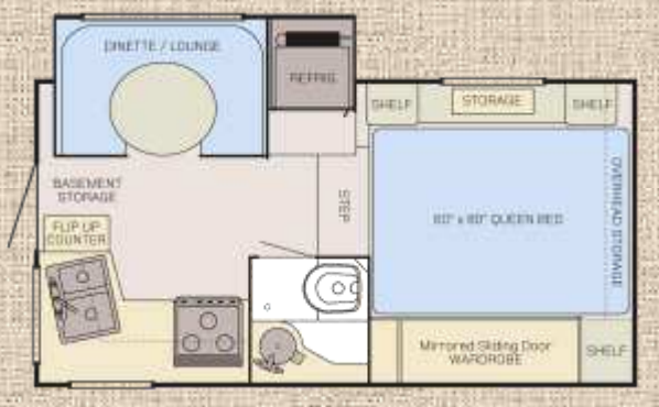
865BS Fits SB & LB Trucks (6' and larger) Note: Fits SB only w/Gen option