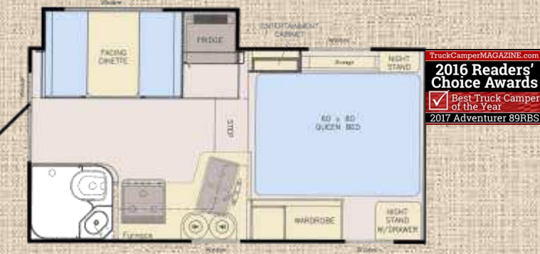
Fits SB & LB Trucks (6' & larger Gen capable with both)